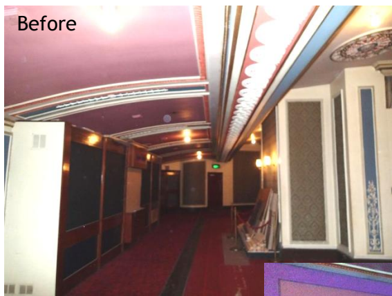
The Studio @ Streatham Hill Theatre