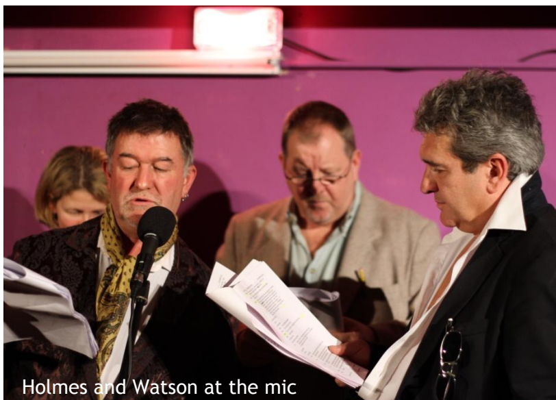
Holmes and Watson at the mic