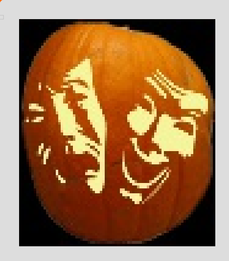
Reminders for October