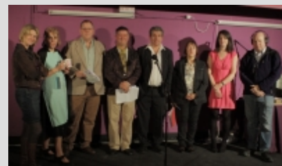
The On the Air cast.

Wednesday 6th to Saturday 9th November 7.30pm for 8pm start