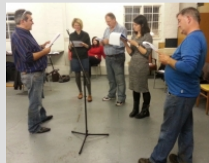
The On the Air cast in rehearsal.

Wednesday 6th to Saturday 9th November 7.30pm for 8pm start